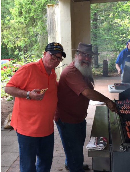
Members attend the Pacific Northwest Chapter's annual "Battle Dogs" event