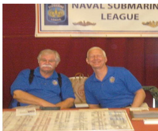
Kitsap County's Veteran's Day